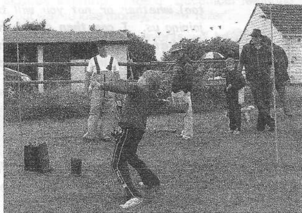
Many wellies were in evidence